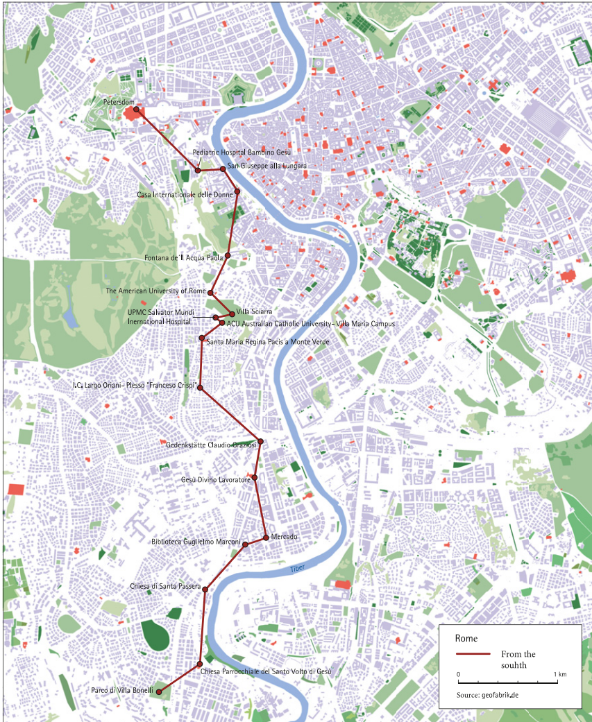
Fig. 11.3. Southern Route.