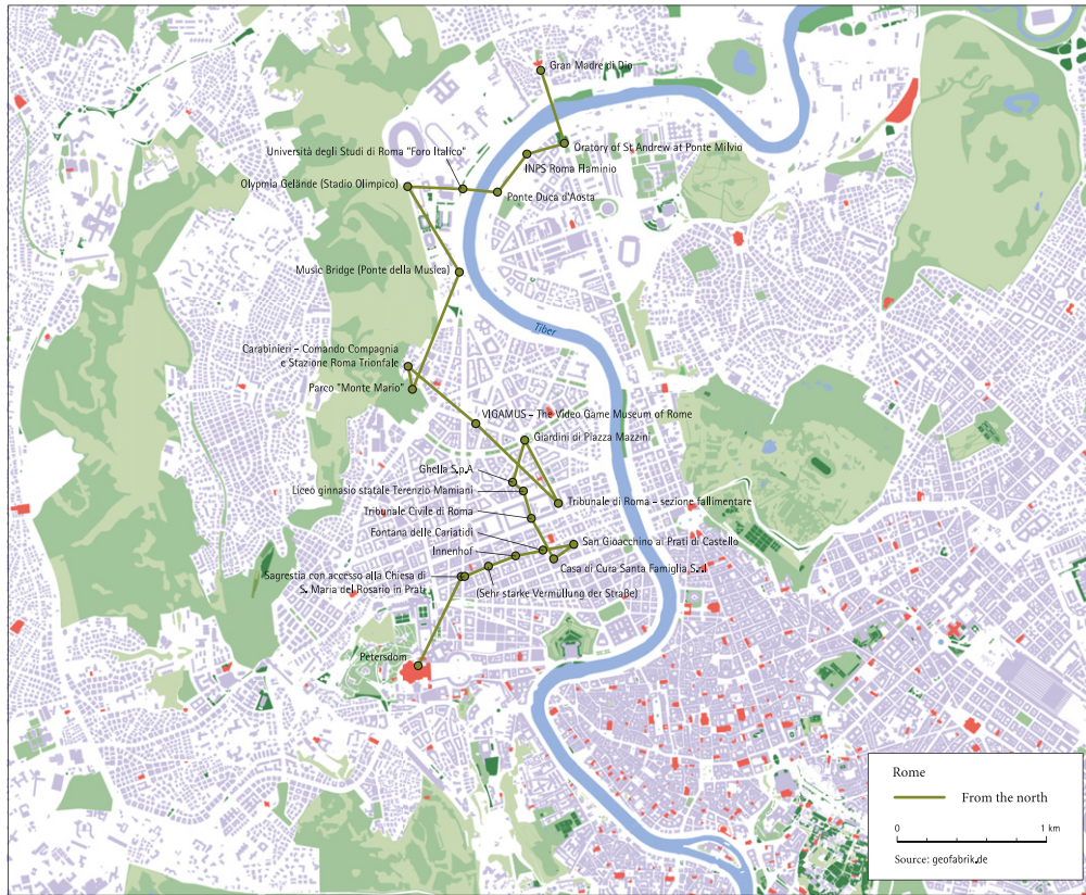
Fig. 11.1. Northern Route.