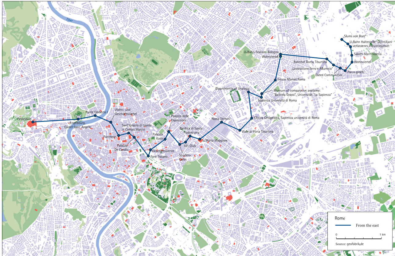
Fig. 11.2. Eastern Route.